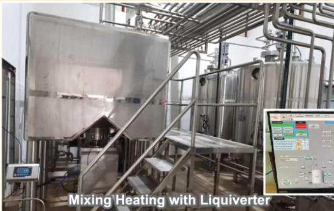
Mixing Heating with Liquiverter