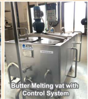
Butter Melting vat with Control System