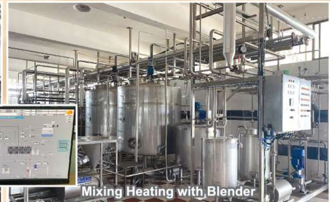
Mixing Heating with Blender