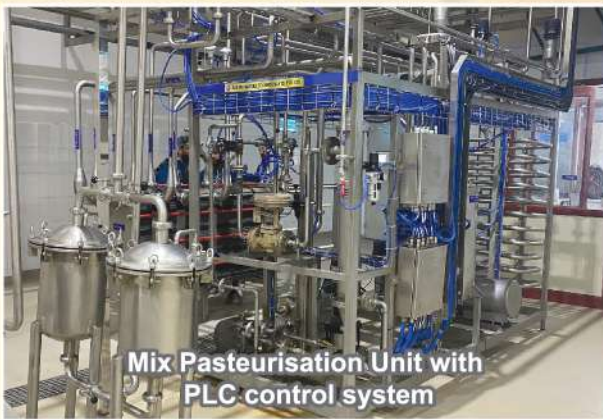
Mix Pasteurisation Unit with PLC control system