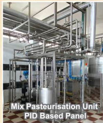
Mix Pasteurisation Unit PID Based Panel