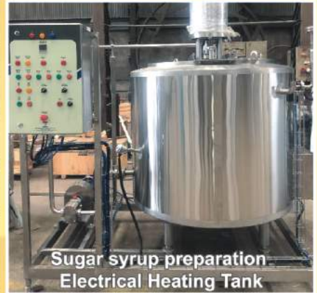
Sugar syrup preparation Electrical Heating Tank