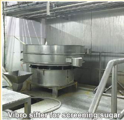
Vibro sifter for screening sugar