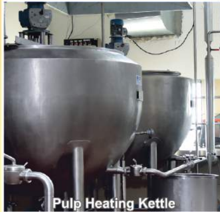
Pulp Heating Kettle