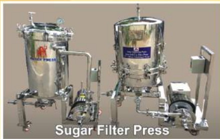
Sugar Filter Press