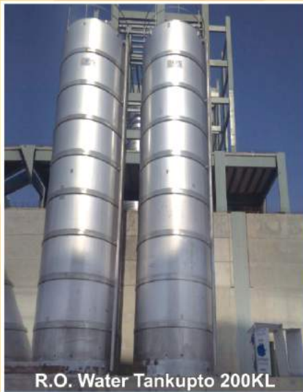
R.O. Water Tank upto 200KL