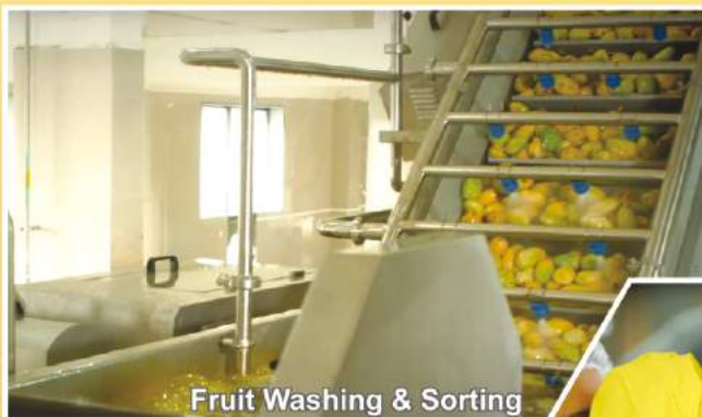
Fruit Washing & Sorting

State of Art Manufacturing facilities equipped with all Latest Machinery